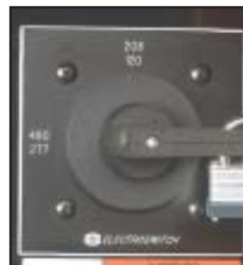
Three Position Padlockable Voltage Selector Switch