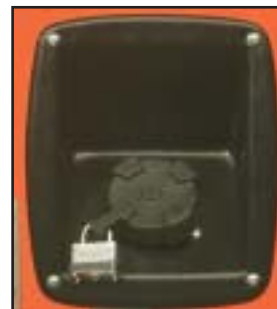
Padlockable External Fuel Cap

Godwin Power –Tough, reliable, easy to use, and available immediately!