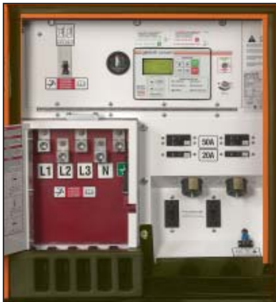
Programmable Microprocessor Control Panel